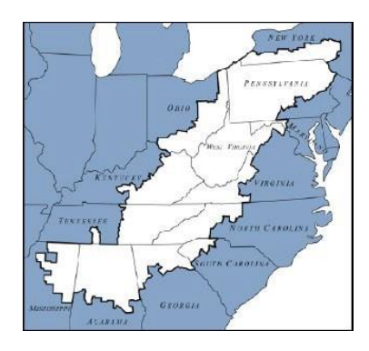
Appalachia – Appalachian Regional Commission

The Green Bank for Rural America will target the 13-state region of Appalachia, Coal and Power Plant Communities nationally, and other underserved rural areas such as Persistent Poverty Counties, NMTC Low Income Communities, federal Opportunity Zones and other areas.