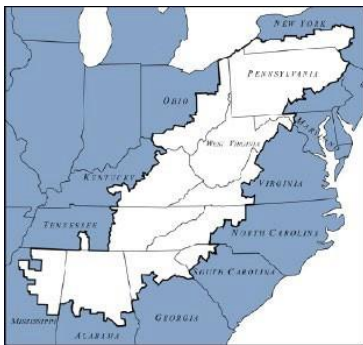
Appalachia – Appalachian Regional Commission

The Green Bank for Rural America will target the 13-state region of Appalachia, Coal and Power Plant Communities nationally, and other underserved rural areas such as Persistent Poverty Counties, NMTC Low Income Communities, federal Opportunity Zones and other areas.