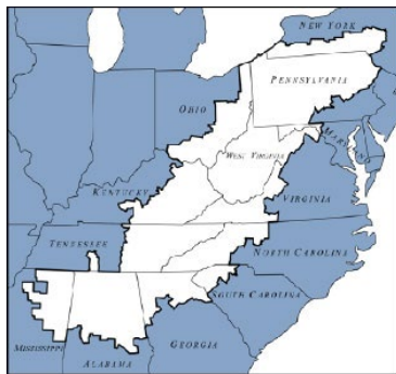
Appalachia – Appalachian Regional Commission

The Green Bank for Rural America will target the 13-state region of Appalachia, Coal and Power Plant Communities nationally, and other underserved rural areas such as Persistent Poverty Counties, NMTC Low Income Communities, federal Opportunity Zones and other areas.