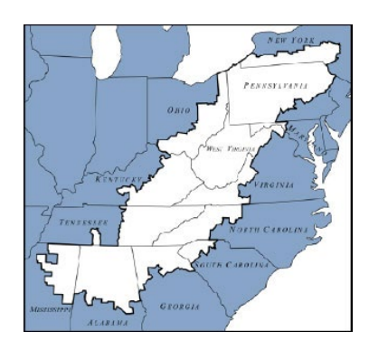
Appalachia – Appalachian Regional Commission