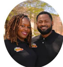
Seed Thyme & Harvest Plant-Based Cuisine